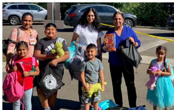
Children received backpacks filled with supplies and toys at the Back to School Backpack program.