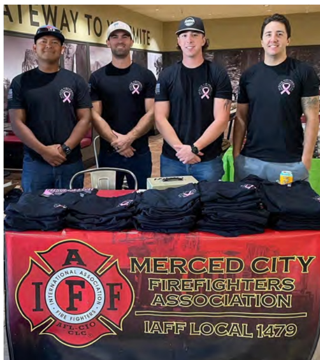
Firefighters hosted a Pink Shirt sale.

Paskin shared about Merced Fire Department's support of Mercy Merced, "We need to collaborate and help each other where we can... We are so grateful to the community - the pink t-shirt program wouldn't be possible without community involvement."