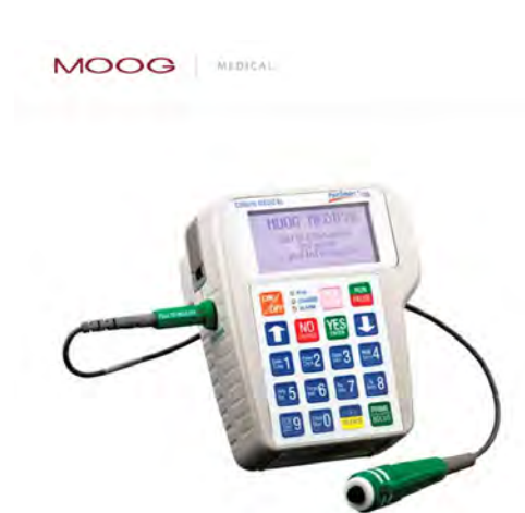
The PainSmart Pumps added to the Family Birthing Center because of Mercy Foundation. Moog Medical, Curlin PainSmart, 2023.