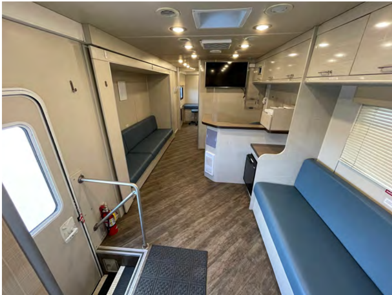
Inside view of the new Mobile Care Clinic.